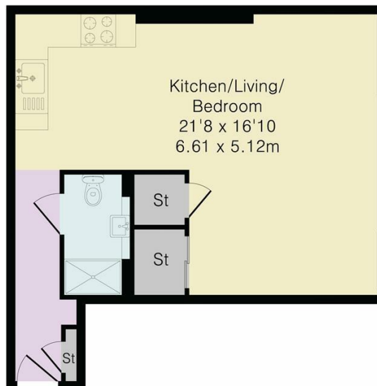
First Floor Flat